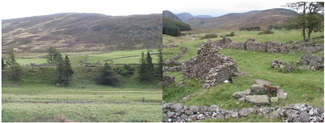
Figs 2 &3 looking to site from Glen Isla Road and looking up Glen Isla from the back (south east) of the site.

1. The application is for the erection a new house on the site of a ruined hill farm which appeared on the first edition OS maps in 1867. The structures include the remains of a small gabled cottage, a long house and various store buildings and enclosures. It is thought that there were at least four buildings and that two households would have occupied the site. The proposed house is to form a lodge serving the combined Glencally, Fergus and Glenmarkie Estate, which extends to over 4,000 acres of mainly sporting land. The site lies on the east side of the River Isla and is set well above the river. The site is quite prominent from the public road up the Glen on the opposite side of the river.