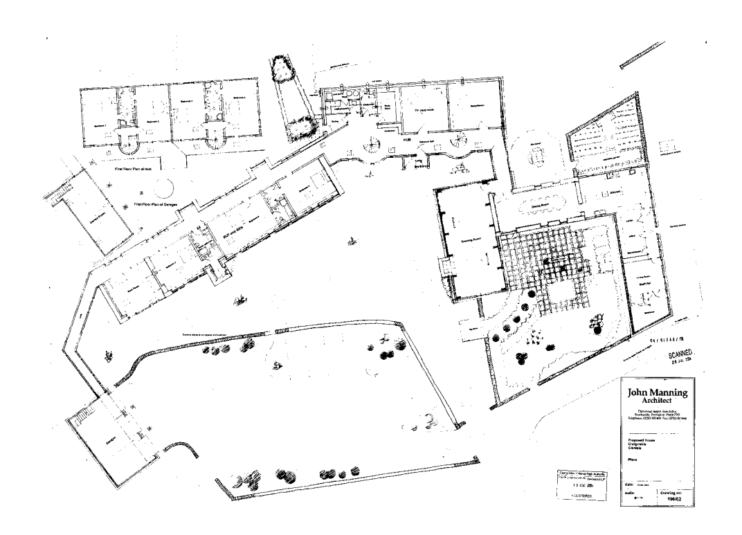
Fig 5 Layout Plan