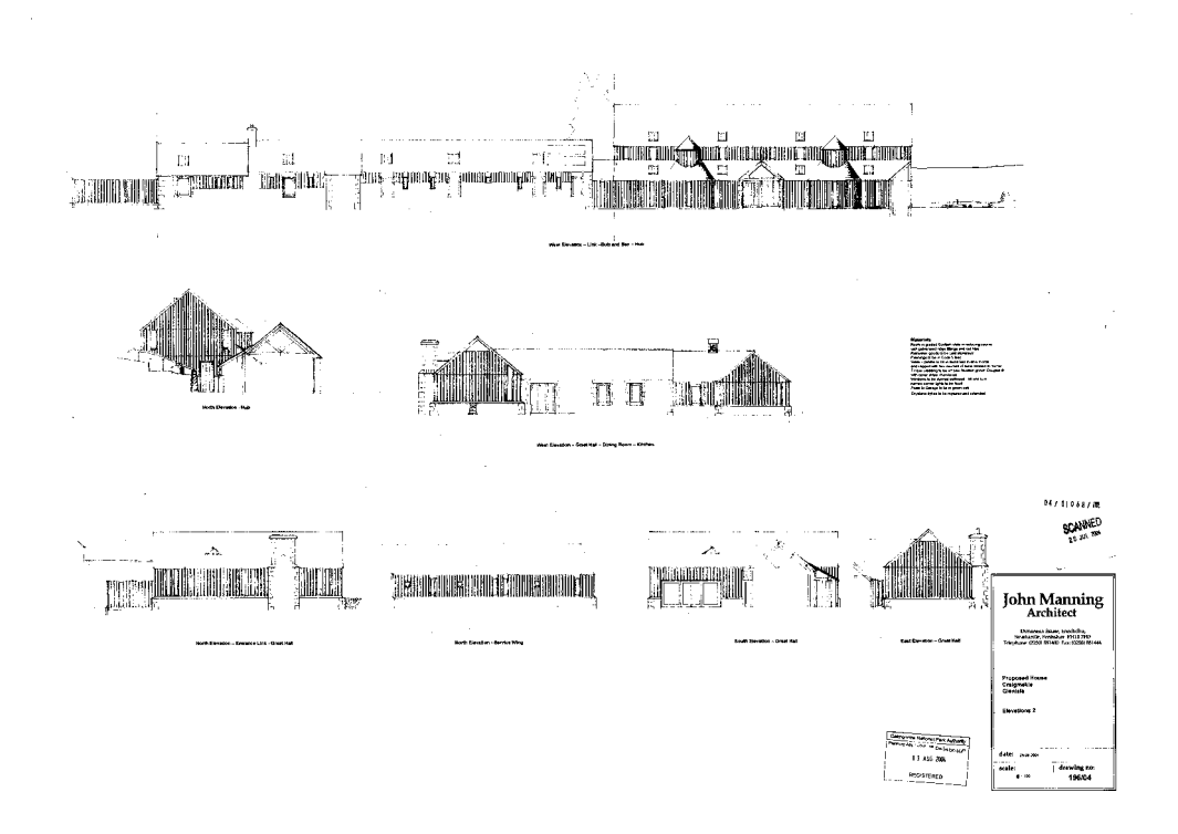
Fig 4 Elevations